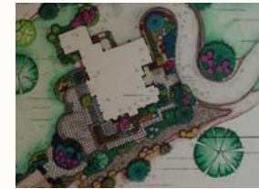
Color designs for easy visual viewing and identification.

Every good landscape begins with a great idea. Atlantic Ridge will take your great idea and formulate a design that best incorporates form and function to best suit your lifestyle. During this process, it will be best to express your current and future needs so we can design a plan that meets all your family's requirements.