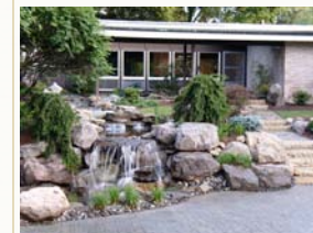
Finished job. Incorporating water into the front yard.

Upon completion of your landscape project, Atlantic Ridge will care for all your landscape maintenance needs. With the company-backed workmanship warranty and the choice to only use the finest construction products that come backed with lifetime warranties on certain products. So all that is left is for you to do is sit back and enjoy!