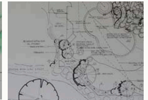
topography master plan layout.