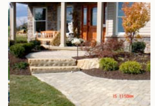
Finished job. Curb appeal makes this house a home.